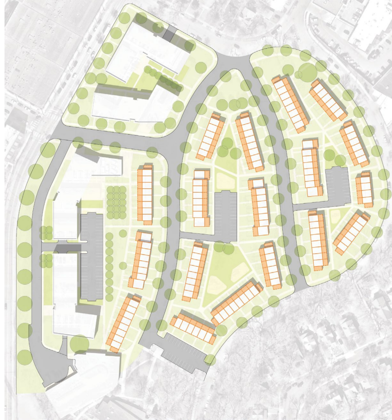
Option 2: Rehab + Additions + New